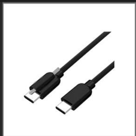
USB-C - C Cable (With Screw)