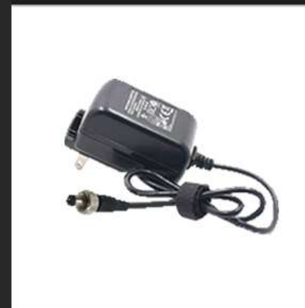
12V 2A Power Adapter