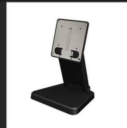
VESA 75mm Bracket