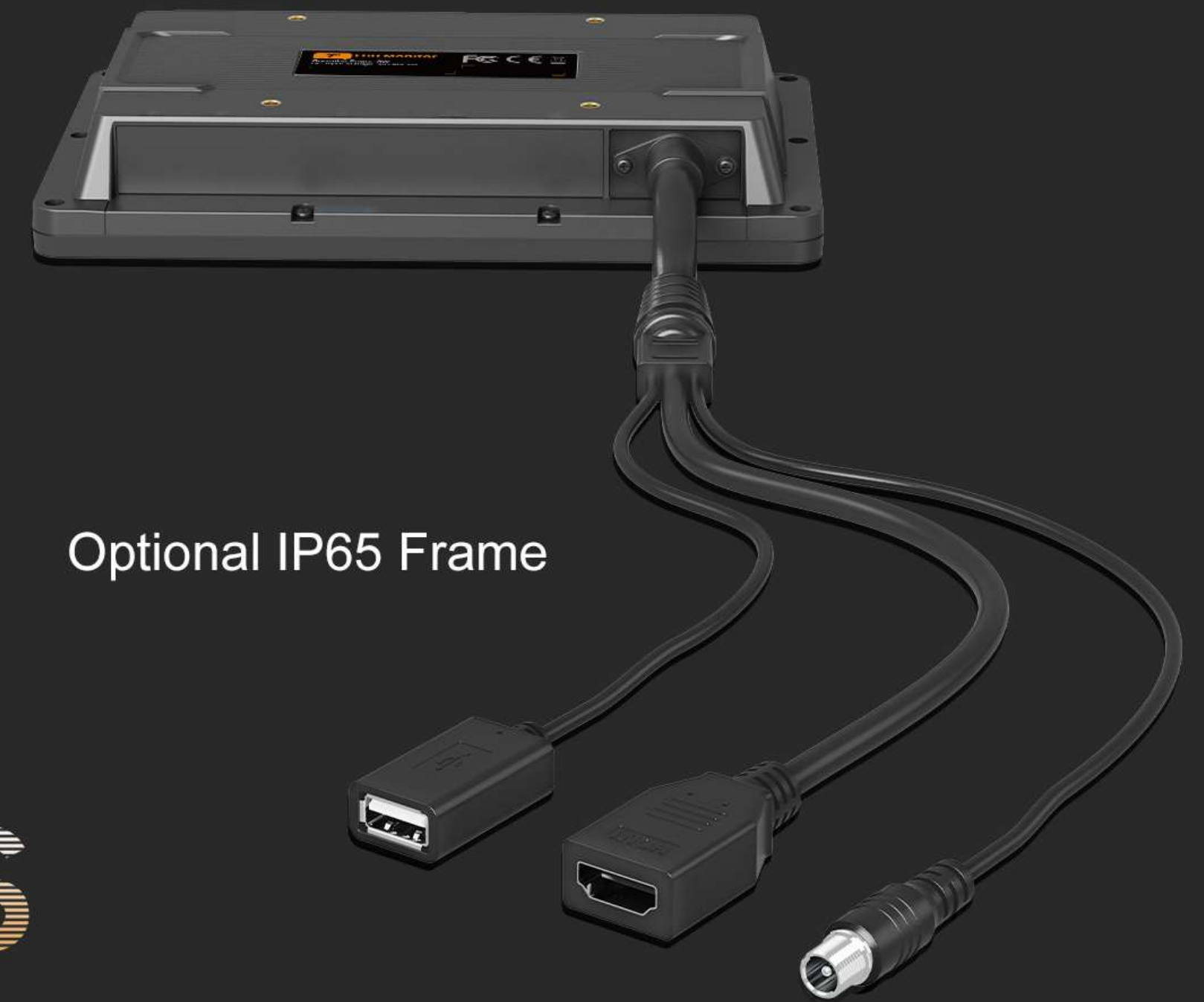
Optional IP65 Frame