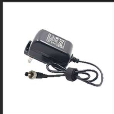
12V 2A Power Adapter