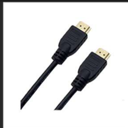
HDMI A-A Cable (HDMI Ver.)