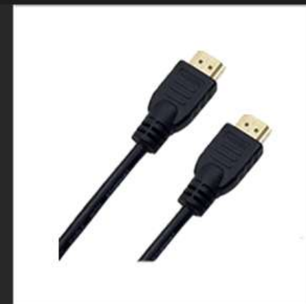
HDMI A-A Cable