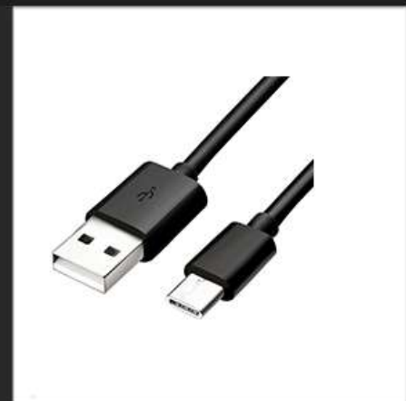
USB-A - C Cable (For Touch)