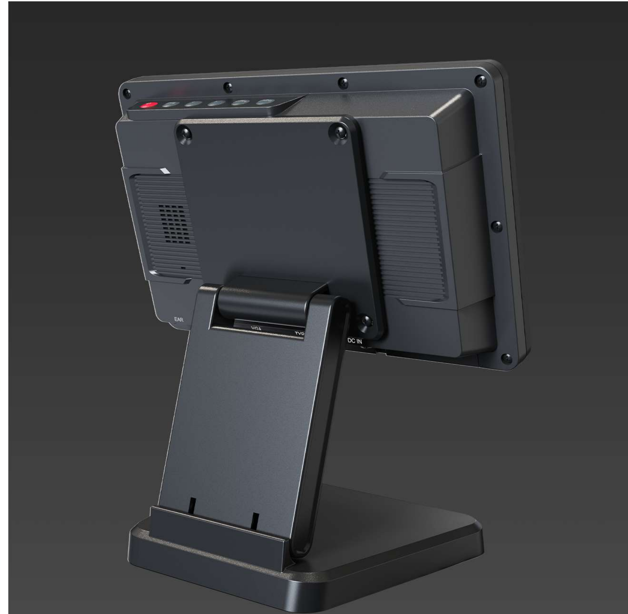
VESA 75MM BRACKET

Quality folding VESA 75mm bracket that can be placed on a table or fixed to ceiling.