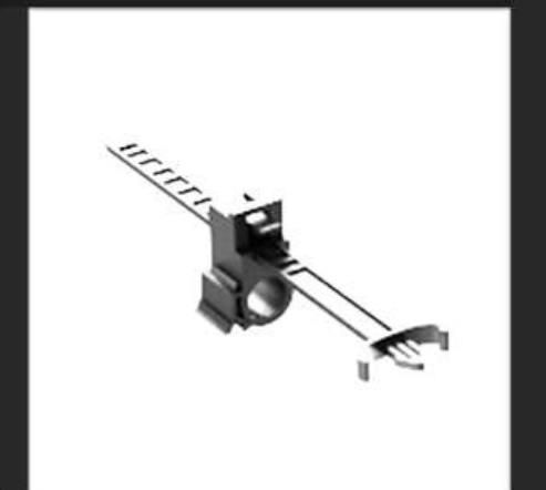
HDMI Cable Lock