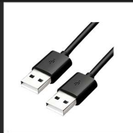
USB-A - A Cable (For Touch)