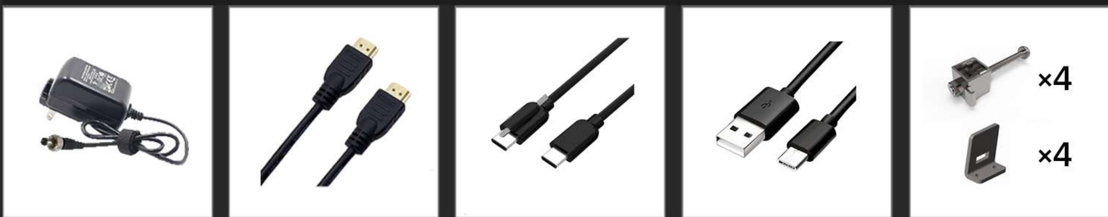
12V 3A Power Adapter